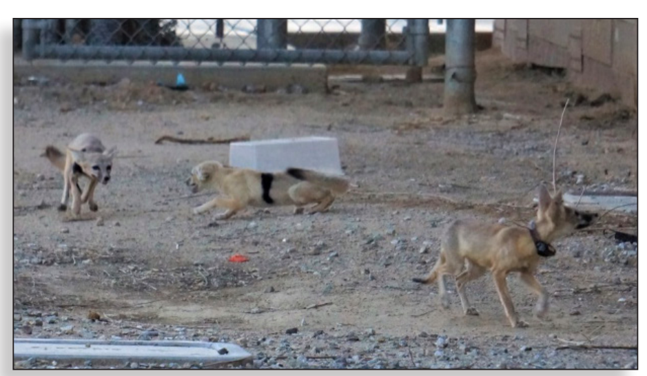
FIGURE 5. Adult female kit fox F7416 (far right, collared), one of her pups (far left), and an orphaned pup cross-fostered into her litter (center, lateral dye marking) were released on 8 June 2022 at the capture location of F7416 and her litter in Bakersfield, CA, USA, following their recovery from sarcoptic mange.

We placed the kennels directly in front of the portable buildings under which the natal den was located. We opened the kennel holding F7416 first so that she might help orient the pups as they were released, and then simultaneously opened the doors to the other kennels shortly after. As the pups saw each other and F7416, they all rushed towards F7416 with their ears tucked back, bodies low to the ground, and tails wagging (Fig. 5). Despite his observed confidence in captivity, the orphaned pup, given unique number identifier M7470, was the most reluctant to leave the kennel and required the most encouragement, including tilting the kennel forward and gently tapping on the back. Once he saw the other kit foxes playfully running around the portables, he quickly joined