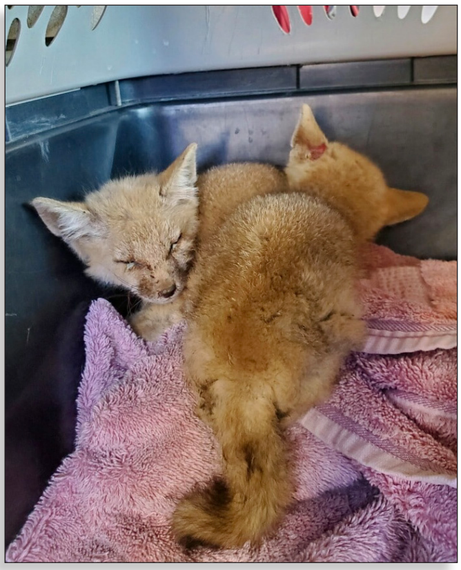
FIGURE 2. Two young kit fox pups with sarcoptic mange were captured on 14 April 2022.

We left the traps open one additional night in an attempt to capture other kit foxes still in the area that might need treatment for sarcoptic mange, particularly an adult caretaker for the pups. While an adult male was captured with mild signs of sarcoptic mange, there was insufficient evidence demonstrating that he was the biological father, and the pups did not appear fully weaned. Thus, we treated him with selamectin, fitted him with a flumethrin collar, and released him at his capture location. We collected the two cameras left at the natal den six days after they were originally deployed. Apart from the sick pups, four other kit foxes appeared in images: the adult male we had previously captured, a second adult, and a pup with an adult that we presumed was its parent. This pup was captured in only one image and appeared slightly larger and in better physical condition than the sick pups, so we concluded that they were likely from a neighboring litter as this area supports multiple kit fox family groups. We then set additional traps for four days in attempts to capture these other individuals, although no additional kit foxes were captured. Two baited cameras were then deployed for an