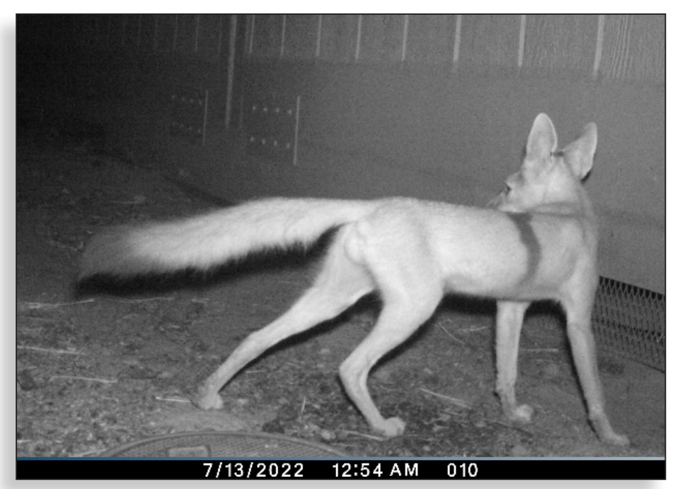
FIGURE 6. Cross-fostered kit fox pup M7470's last appearance on a trail camera on 13 July 2022 in Bakersfield, CA, USA.

them, though he was observed lingering outside the portables and sniffing the environment more so than the others, who had all eventually retreated under the portables. This was not unexpected behavior as the release site was a novel location for M7470.