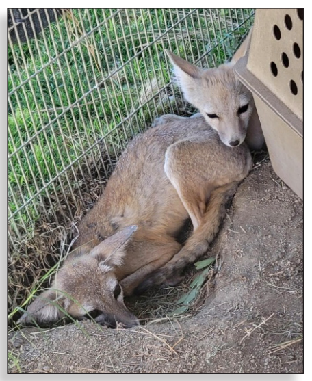
FIGURE 4. Kit fox F7416 and an orphaned pup that was cross-fostered into her litter nestled together at the California Living Museum in Bakersfield, CA, USA on 1 June 2022, while receiving treatment for sarcoptic mange.

ously. The kit foxes were closely monitored for 1 wk following the introductions. During this time, all kit foxes continued to exhibit normal behaviors, with the only notable behavior being the orphaned pup seemed bolder and displayed more assertiveness towards food which may have been attributed to him being at CALM for the longest amount of time.