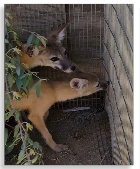
FIGURE 3. Kit fox F7416 and one of her pups investigating the fence line of the adjacent pen containing an unrelated orphaned San Joaquin kit fox pup at the California Living Museum in Bakersfield, CA, USA on 31 May 2022.

Within the first day, the pups were all playing together. The orphan became more confident when approaching F7416 for direct contact and she accepted him as she did her own pups (Fig. 4). After their integration, all the kit foxes were fed together, and no negative behaviors were observed. Considering this a success, the orphaned pup was left with the F7416 and her pups continu-